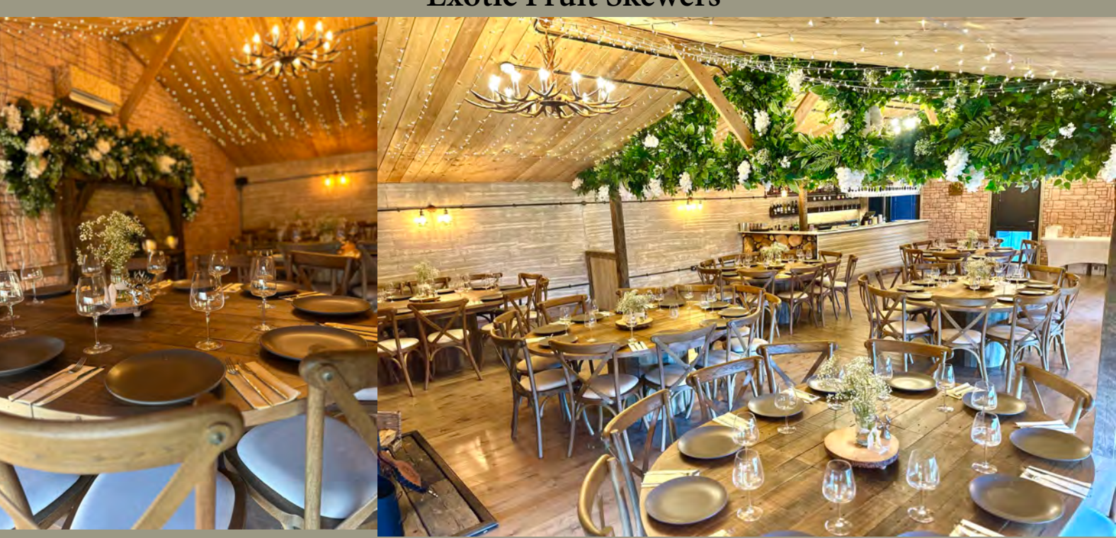
Hog roast buffet £13.95

Smoked Salmon & Cream Cheese Bagels Ham & Cheese Croissants Cheese & Tomato Croissants (v) Smashed Avocado & Feta Crostini (v) Scrambled Egg & Bacon Crostini Danish Pastries Granola, Yoghurt & Berry Pots Exotic Fruit Skewers